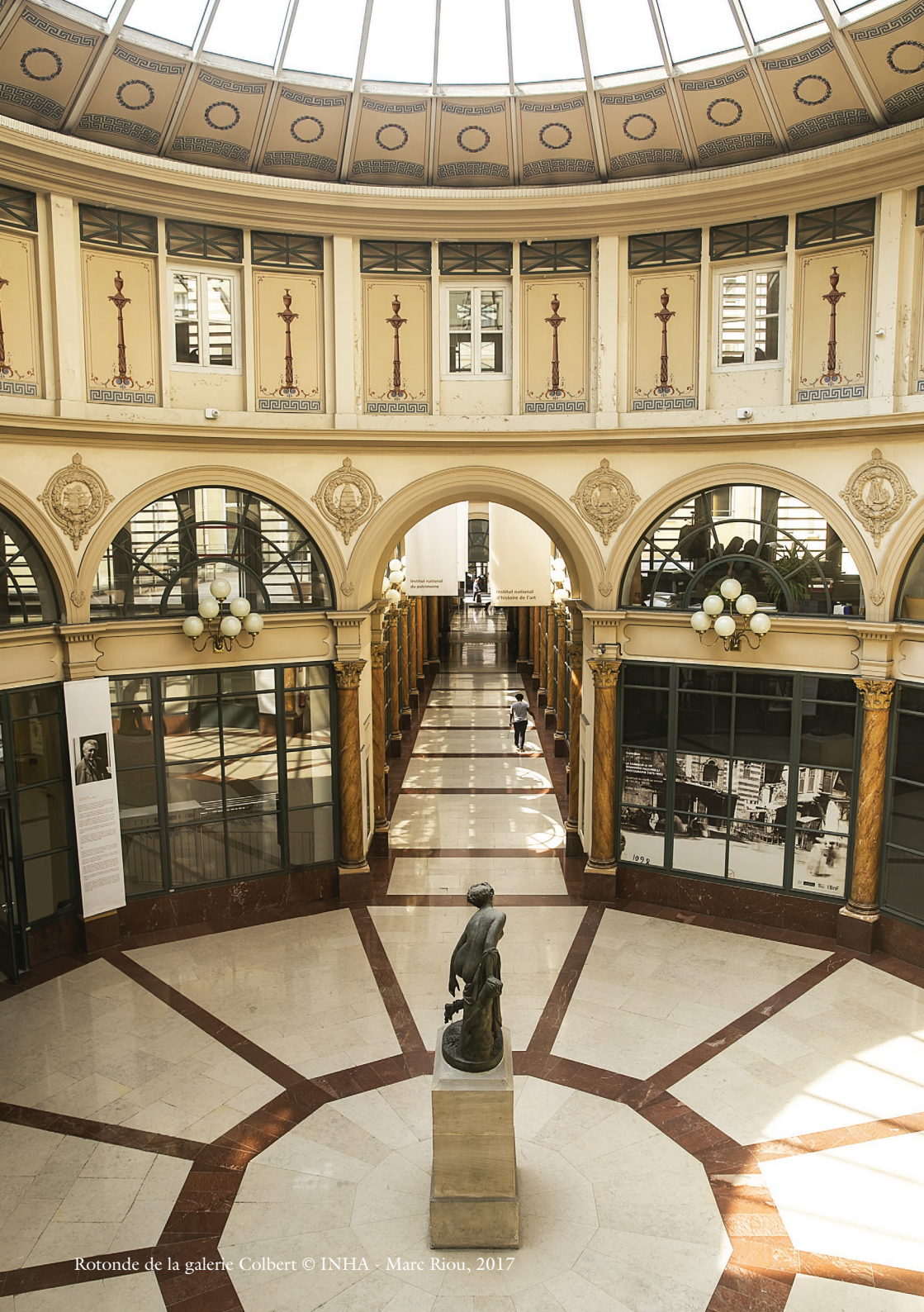
Rotonde de la galerie Colbert