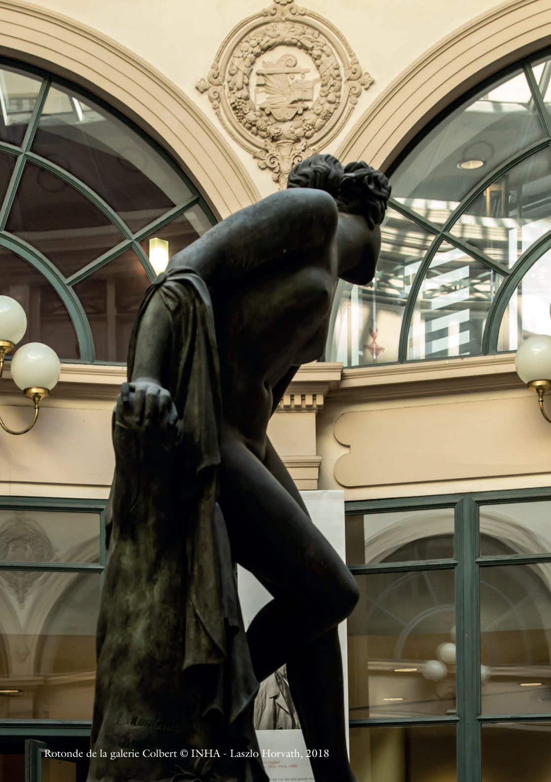
Rotonde de la galerie Colbert

Auguste Rodin Le Penseur 1880 - Paris, 1917